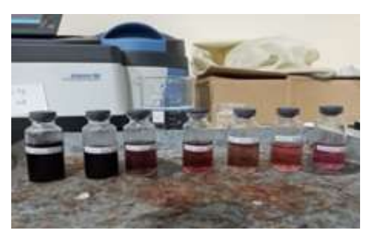
Figure 2. Rat skin hydroxyproline solution.